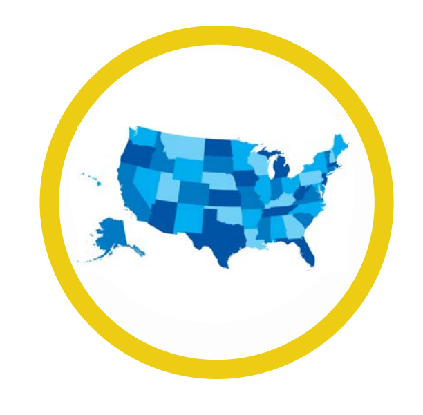
State Medicaid Agency